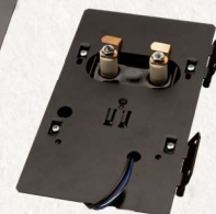
5250004U - Wayne EH/ EHASR