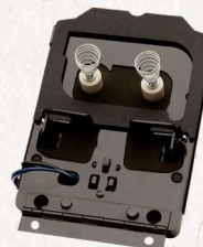
5250001U - Beckett AF/AFG