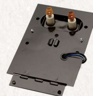
5250003U - Wayne MSR