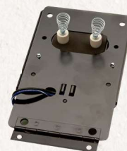
5250002U - Beckett SF/SM, CF500, CF800